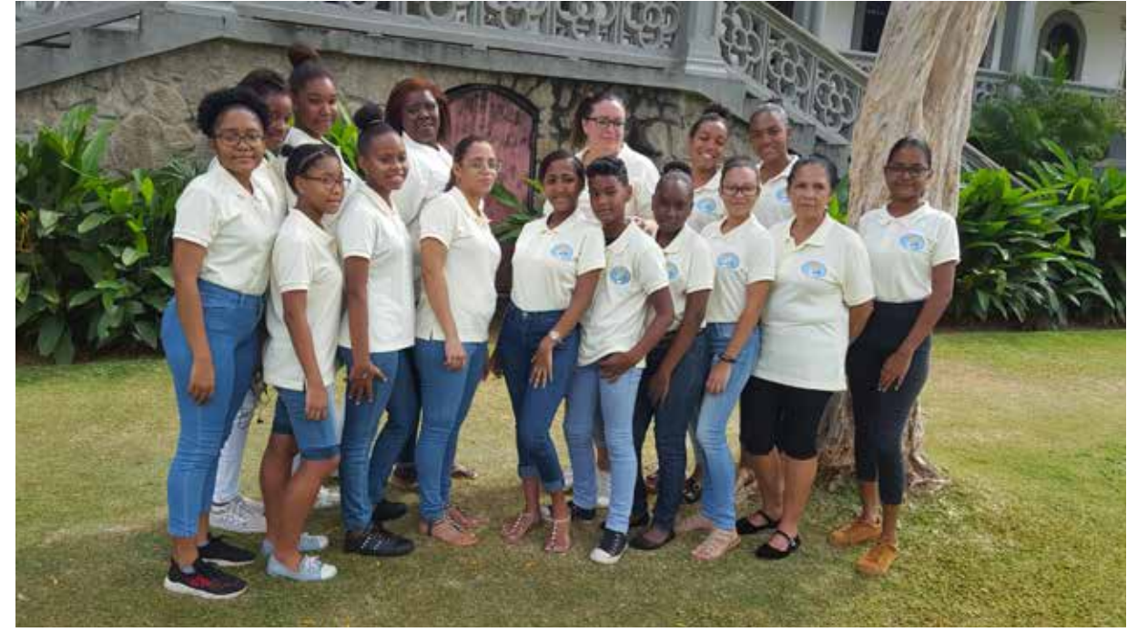
Angels Choir in the grounds of the Cathedral